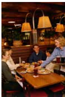
Bars / Table Service Restaurants