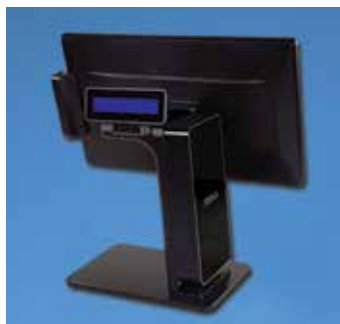
Optional Integrated 2-Line LCD Customer Display