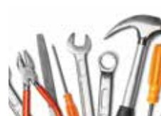
Hardware, Paint or General Retail Stores