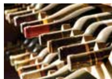
Tobacco Stores / Liquor Stores