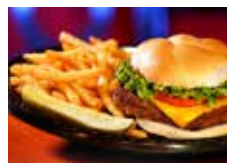
Quick Service / Fast Casual