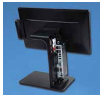
Easy Access to Ports – Easily Replace SSD and RAM Without Tools