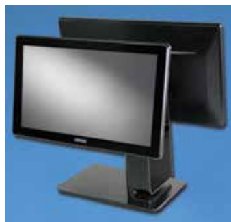
Choose From 10.1" or 15.6" Optional Integrated Rear LCD Customer Displays