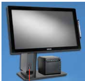
Two Additional USB Ports