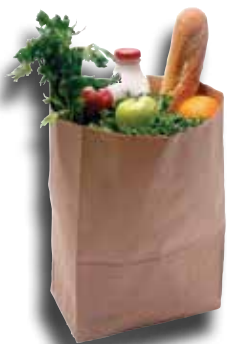
Convenience / Small Grocery